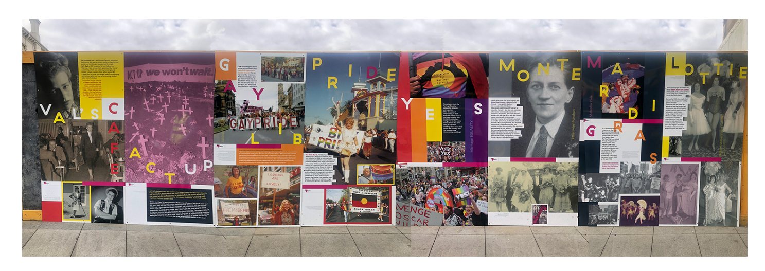
Image: Hoardings\ highlighting\ ALGA\ collection\ created\ for\ the\ façade\ of\ the\ Victorian\ Pride\ Centre-designed\ by\ Lin\ Tobias