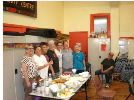
Past and present collective members of VWLLFA at the 30th birthday party