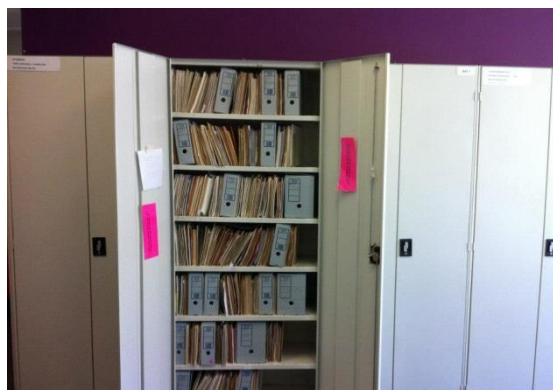
Ephemera filing in progress. The buff-coloured acidic manila folders are gradually being replaced by the grey-coloured archival type @ 47c each. Expensive yes, but Grey is good!

Additional ephemera has been added to a range of files, notably material relating to the Northern Rivers gay commune Mandala and the Sydney social group Boomerangs. A number of weekend working bees are about to be scheduled to reduce the Ephemera Collection backlog and newly received ephemera.