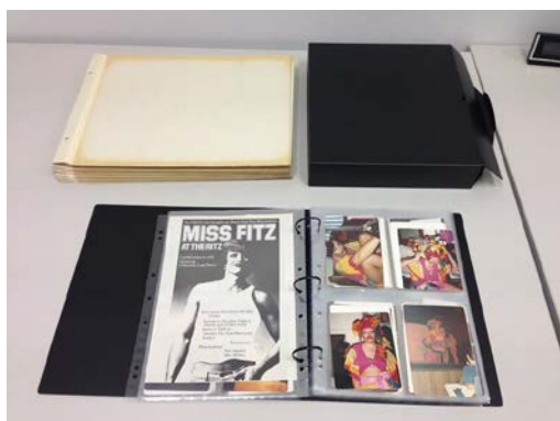
Preservation rehousing of the Ian Dunstan collection

There has been quite a bit of preservation rehousing being undertaken on the Photographic Collections in recent months, including 800 photographs in the Papers of Bob Buckley, and 402 photographs in the Ian Dunstan Collection. Both these photographic collections were previously housed in their original sticky