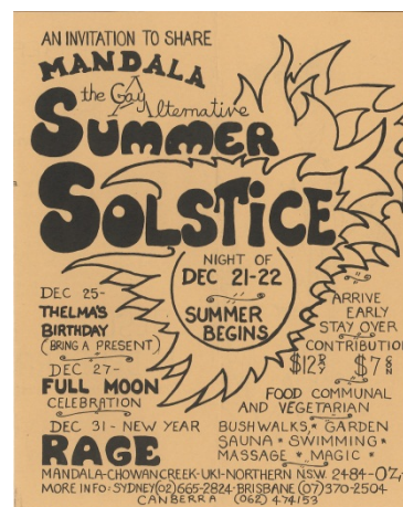
Mandala flyer c.1984

Additional ephemera has been added to a range of files, notably material relating to the Northern Rivers gay commune Mandala and the Sydney social group Boomerangs. A number of weekend working bees are about to be scheduled to reduce the Ephemera Collection backlog and newly received ephemera.