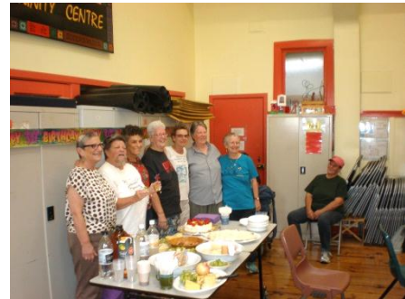
Past and present collective members of VWLLFA at the 30th birthday party